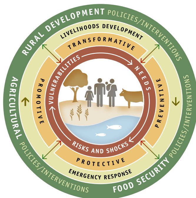
FIGURE 1 Embedding social protection within FSN, agricultural and rural development strategies

agriculture as well as rural development; promote the incorporation of social protection into poverty reduction strategies, risk management and contingency plan, as well as national development plans; build capacity of stakeholders for coherence in planning and designing social protection systems alongside rural development plans; and coordinate its efforts with investments in rural and urban areas. 11